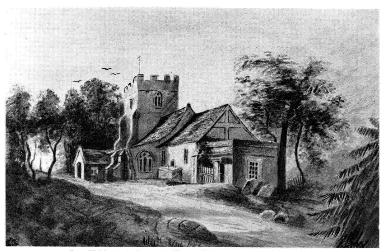
Brent Eleigh church, showing the library adjoining the east end of the chancel. (from an early 19th century water colour; block kindly lent by The British Publishing Company Ltd., Gloucester).